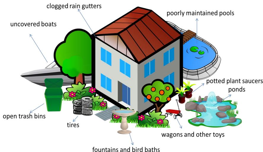
Figure 2. Common backyard mosquito sources.